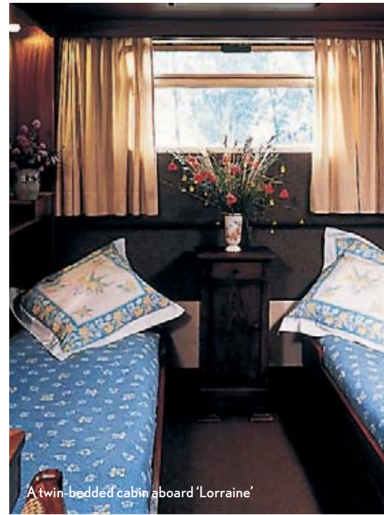
A twin-bedded cabin aboard 'Lorraine'