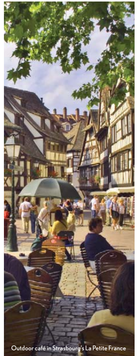
Outdoor café in Strasbourg's La Petite France