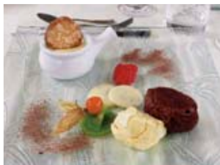
A Chocolate & Wine Cruise creation

Enjoy a tour of Auxerre with its narrow streets and beautiful Cathédrale St-Étienne, with a tasting of the local wine-based