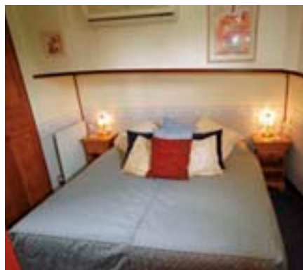
Your comfortable cabin on board 'Elisabeth'

Departures from Apr 04 to Jun 13 and Aug 29 to Oct 24 — contact A&K for details.