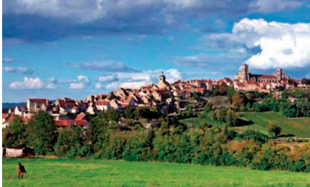
A scenic view of Vézelay

Note: Route runs in reverse on alternate weeks.