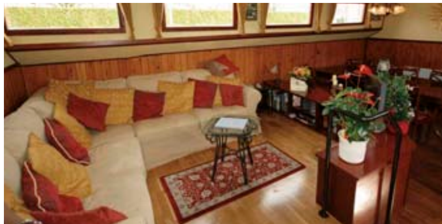
Relax in the inviting on-board lounge