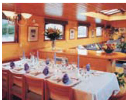
An elegant dinner table is set

Contact A&K for details. Other routes available upon request.