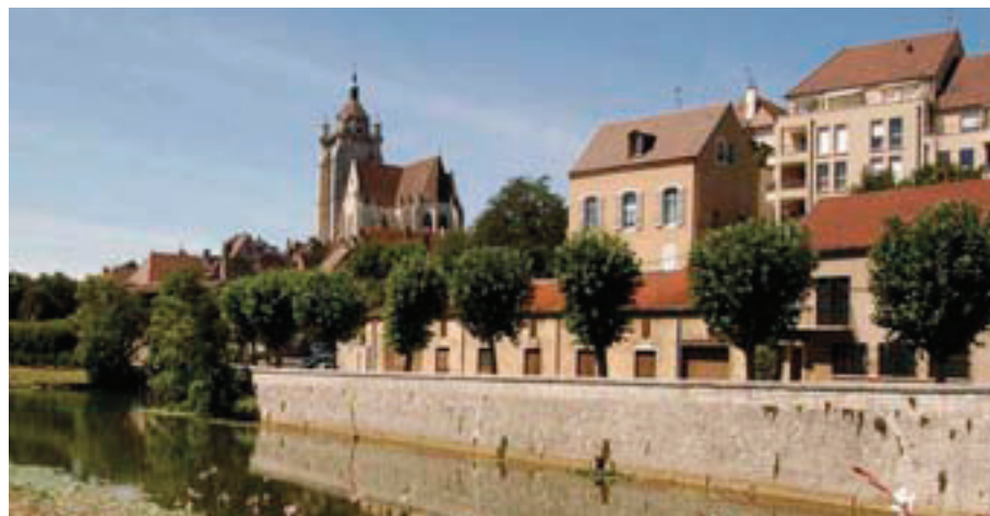
A typical Burgundy countryside view