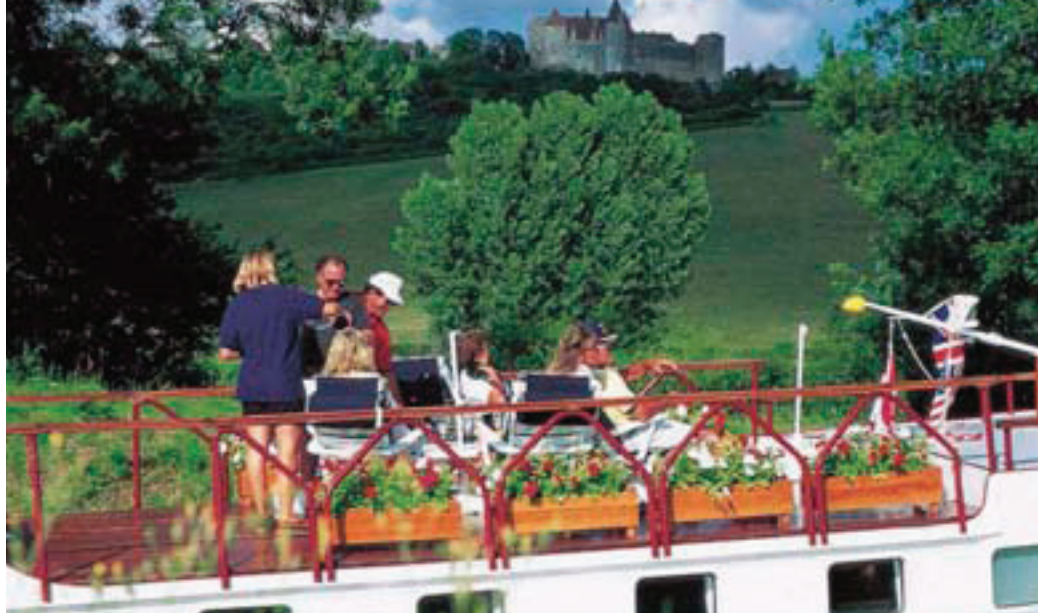
Enjoying a glass of wine and the sunshine on board 'Hirondelle'

'Hirondelle' can travel in tandem with 'Fleur de Lys' (pages 52 – 53) and 'Amaryllis' (pages 54 – 55) to accommodate larger groups.