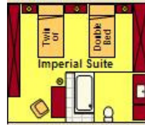
The Imperial Suite Layout

Rates are per person, Double Occupancy Program: Fly into Paris, TGV train to Dijon to Cruise Departure