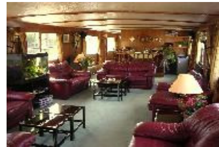
Salon for Gathering