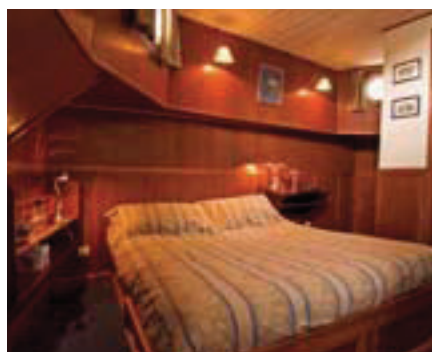
Your comfortable 'La Belle Époque' cabin