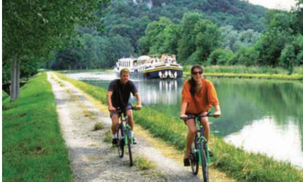
Cycling along a scenic towpath

'La Belle Époque' can travel in tandem with 'L'Art de Vivre' (pages 38 – 39) to accommodate a maximum of 21 charter passengers.