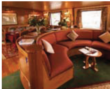
Relax with a book in the on-board lounge

'LA BELLE ÉPOQUE' Length: 126 feet | Width: 16.5 feet Passengers: 13 | Crew: 5