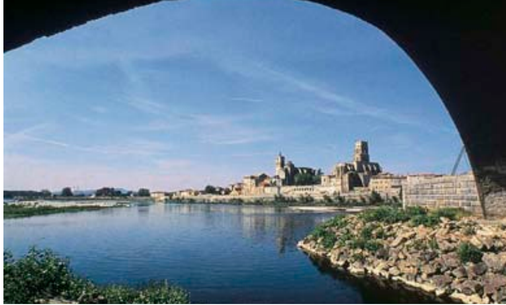
Avignon from the River Rhône

Extend your stay with pre- and post-cruise hotel nights. Contact A&K for details and pricing.