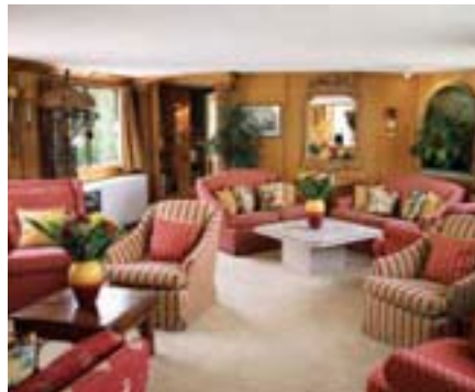
The comforts of 'Napoléon's' salon