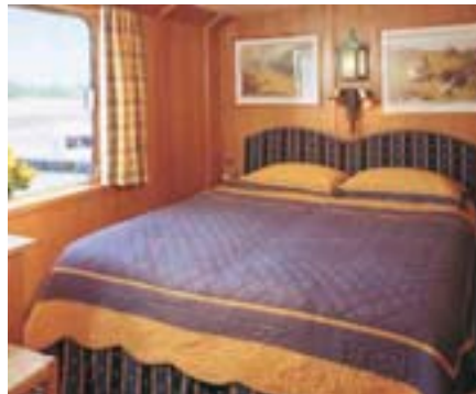
An inviting cabin on board