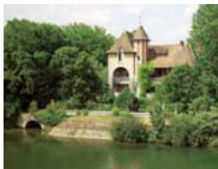
An elegant waterside property in Burgundy

Meet in Paris at Hotel Ampère for transfer to 'Renaissance,' moored in Montargis. After a lovely champagne reception, enjoy a delectable dinner in the elegant dining room and an evening cruise through the town, known as the 'Venice of the North' for its network of canals and delightful flower-bedecked bridges.