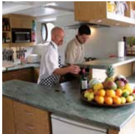
The chef prepares another gourmet meal