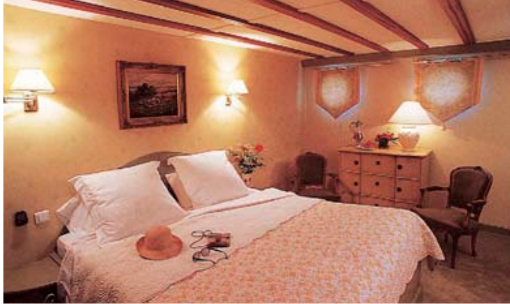
Spacious cabin on board 'Renaissance'

Extend your stay with pre- and post-cruise hotel nights. Contact A&K for details and pricing.