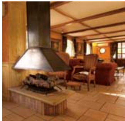
The inviting lounge on board