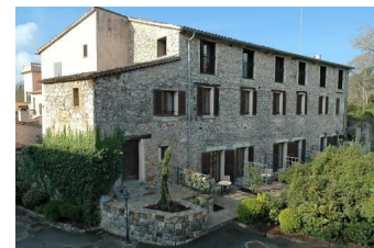
Chateau de la Begude