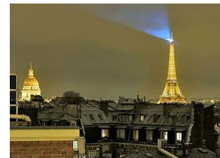
Dining View of 'Paris la Nuit'