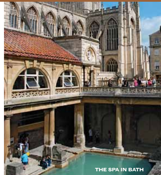
THE SPA IN BATH