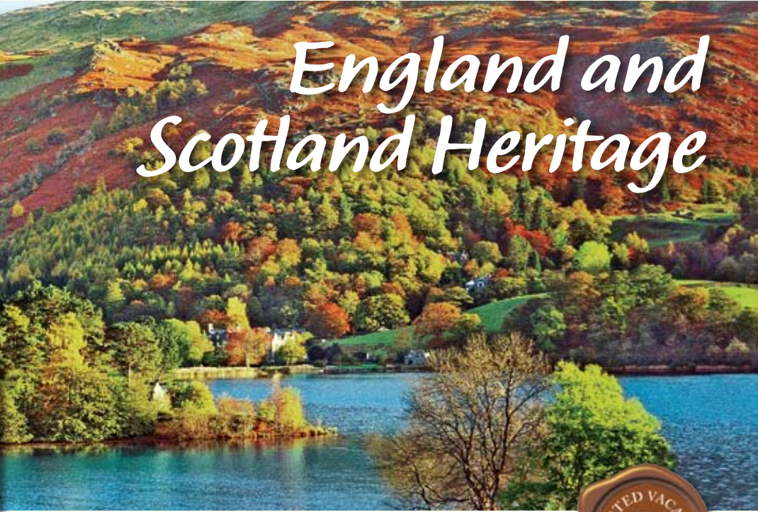
England's magnificent Lake District