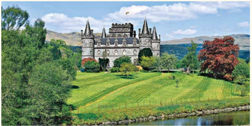
Inverary Castle, home to the Dukes of Argyll

A guided sightseeing tour shows you the Royal Mile, Princes Street and the famous castle. It is in the courtyard of the castle that the spectacular annual event known as the "Edinburgh Tattoo" takes place in August as part of the wider Edinburgh Festival. Later there is free time to explore further and to shop for souvenirs. Tonight, maybe enjoy a lively Scottish banquet with traditional haggis and bagpipe music? (B)