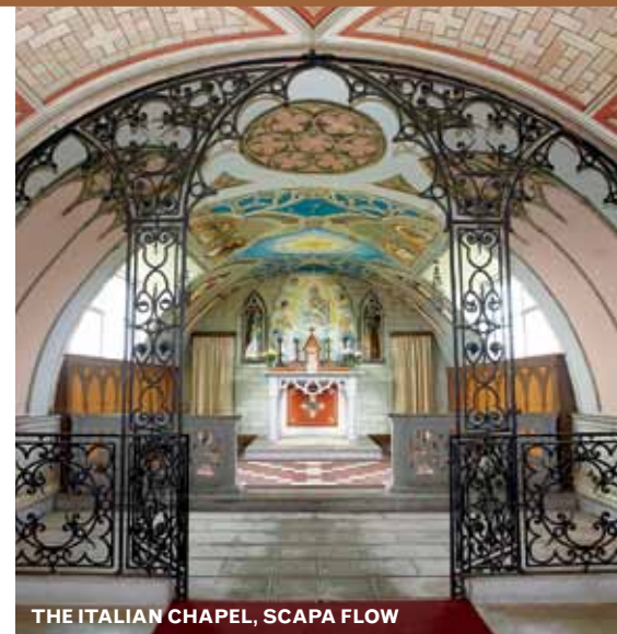
THE ITALIAN CHAPEL, SCAPA FLOW