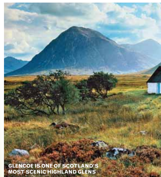
GLENCOE IS ONE OF SCOTLAND'S MOST SCENIC HIGHLAND GLENS