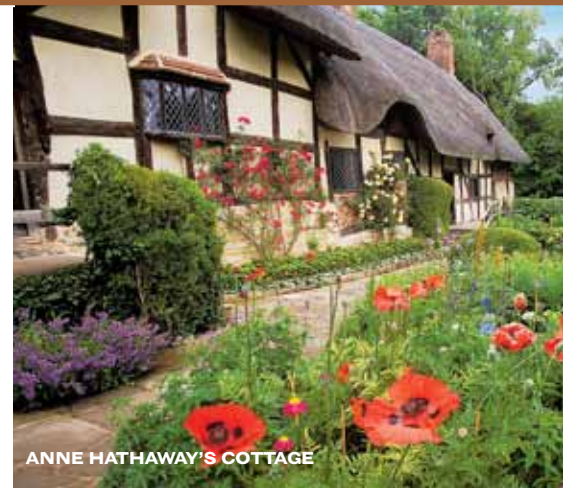
ANNE HATHAWAY'S COTTAGE